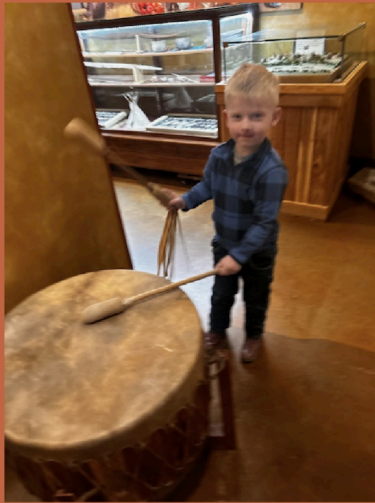
A young historian playing us a song!