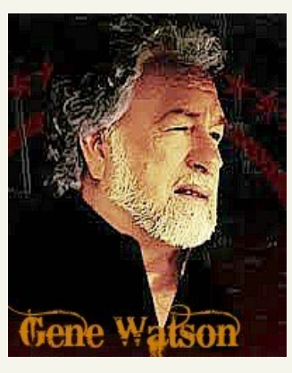
2 Tickets from Bowie Community Center