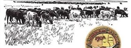
The Old Chisholm Trail

During this day camp, kids will learn about some of Nocona's link to the Chisholm Trail and the cattle drives that shaped Montague County. They'll also be involved in fun, hands-on activities relating the area's unique history, and hear exciting stories and tales from entertaining story-tellers.