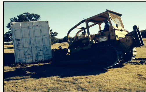
TnT Board member, Chase Fenoglio, prepares to move storage containers for the new barn that will house our agricultural exhibits and new classroom.